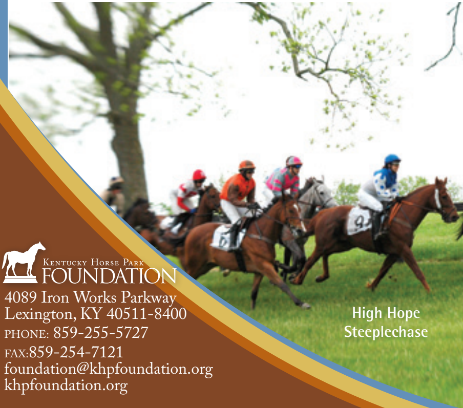
High Hope Steeplechase

For a complete listing of all events at the Kentucky Horse Park, please go to www.KyHorsePark.com