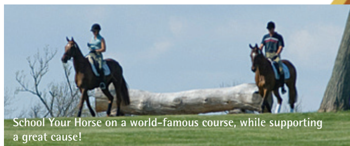
School Your Horse on a world-famous course, while supporting a great cause!

For more information please call the Kentucky Horse Park Foundation at 859-255-5727. ♦